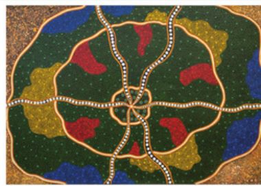
Image caption: Sharon Smith / Bunyas artwork 2020 / Acrylic on canvas / 100cm x 100cm

40 Burrows Street, SURAT | 4617 08 4628 1136 surat@suratnongallery.com.au