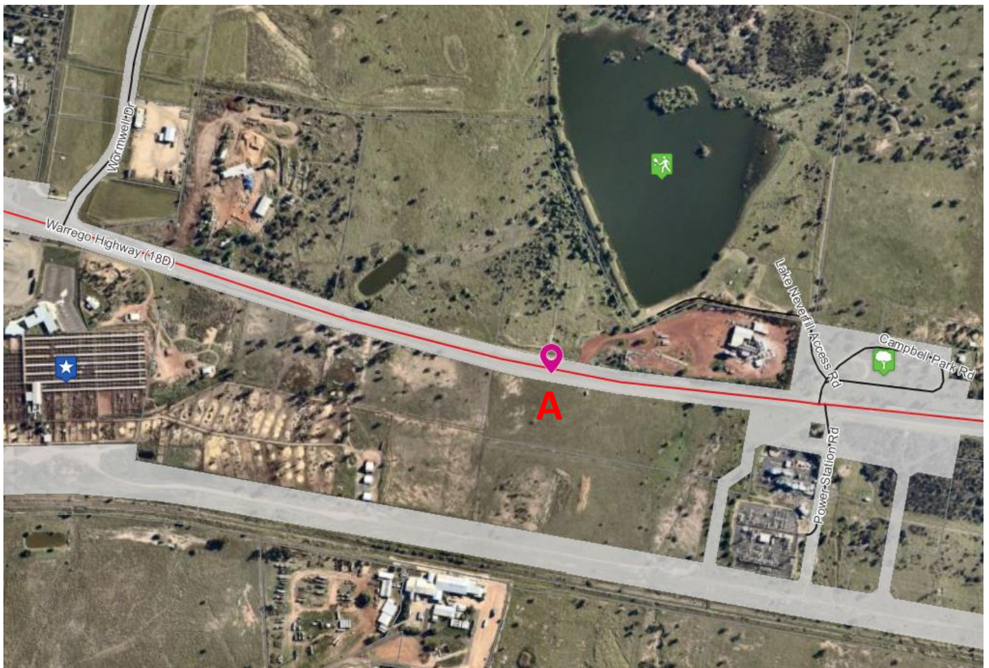
Figure 1: Proposed Signage Location

Applications are invited to place advertising signage on proposed locations. The locations marked in Figure 1 has been identified as a potential location for the installation of a sign. This location will be referred to as Site A for the purpose of this document.