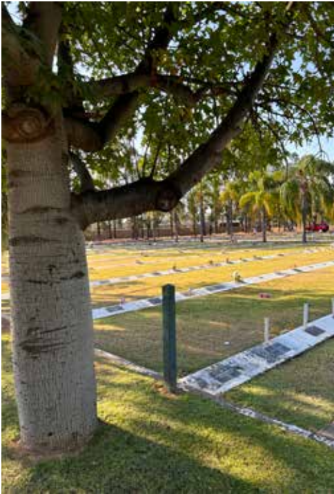
PHOTOGRAPHS SHOWING INTENT OF THE PROPOSED LAWN CEMETERY AT SURAT