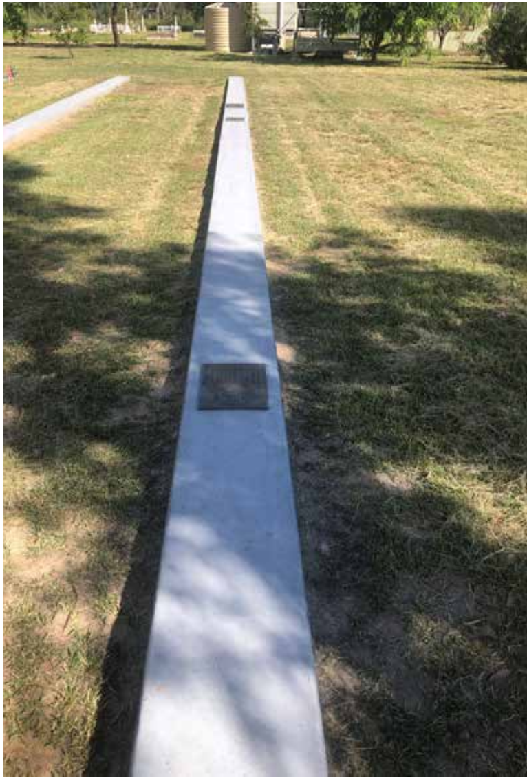
PHOTOGRAPH SHOWING INTENT OF THE PROPOSED LAWN CEMETERY AT SURAT

PO Box 1640, Buddina, Sunshine Coast, QLD 4575 T: 07 5493 4677 E: admin@greenedgedesign.com.au www.greenedgedesign.com.au